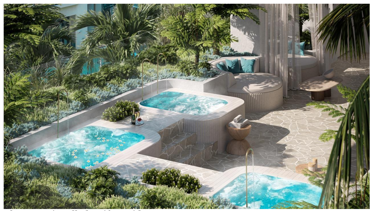
The tower is called Drift Residences

"I look forward to personally taking up residence in this remarkable building and seeing it fulfil its promise as the epitome of a Main Beach lifestyle."