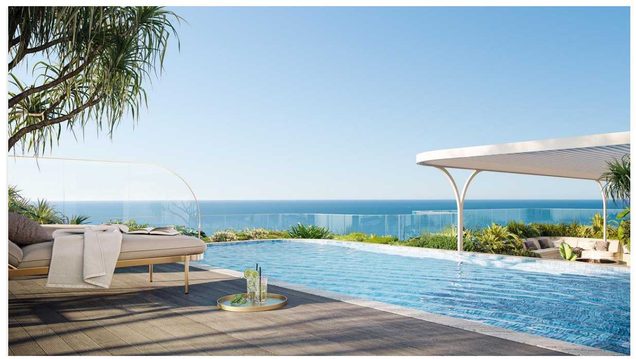
The developer behind the project intends to live in the tower himself.

It is <u>the latest in a range of new tower projects</u> pitched for central Main Beach in the past year.