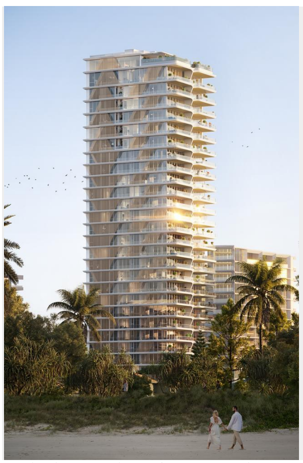
Artist impression of 27-storey luxury Main Beach apartments by GDI Group