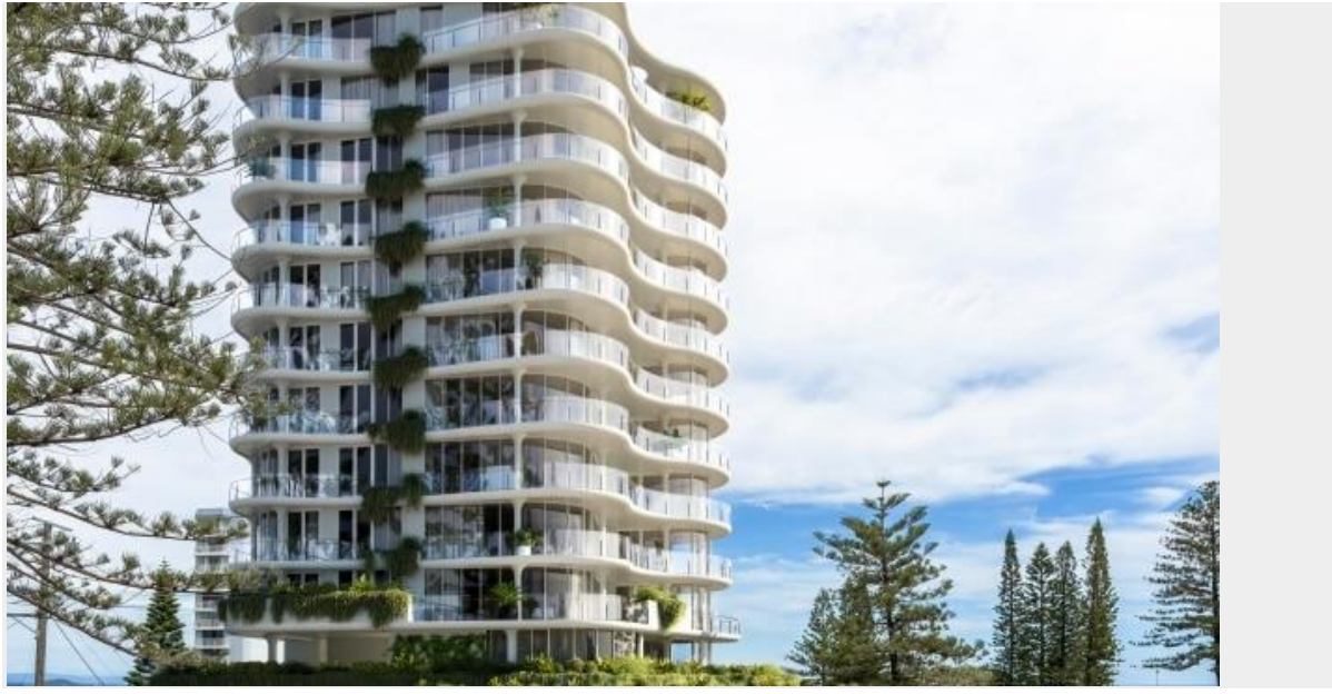
Artist impression of Awaken Residences

Of the remaining units, four were locals, three were from Sydney and another from overseas.