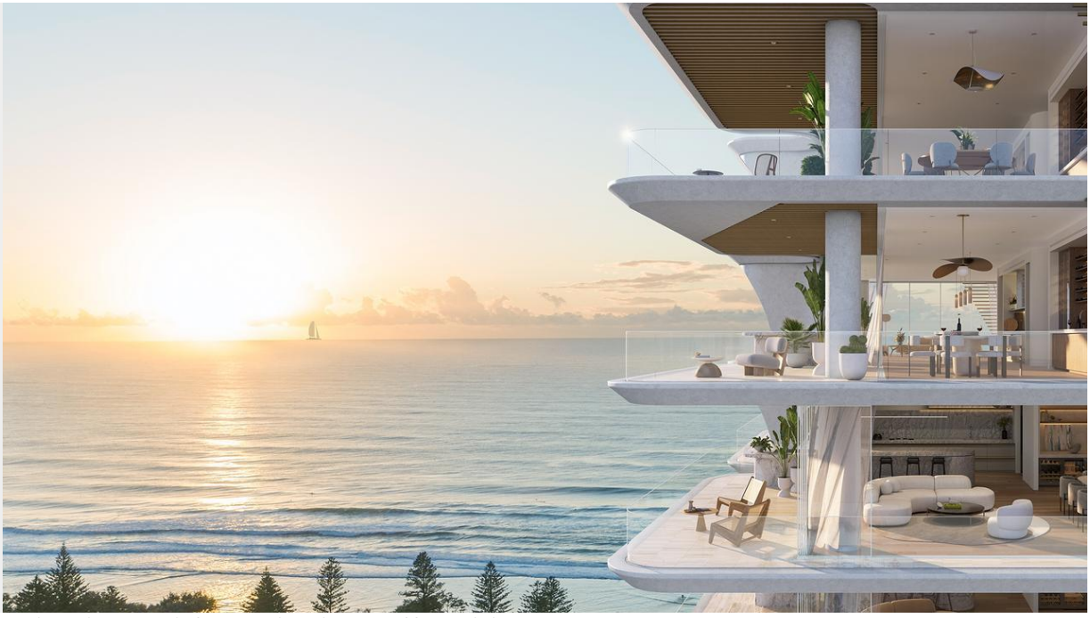
It is planned for a site just off Tedder Ave.