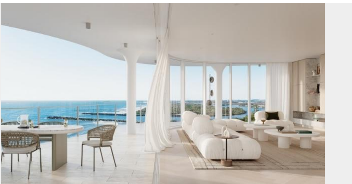
Awaken Residences, Gold Coast

"There is huge demand for land on the Gold Coast, but particularly for the central area as there is very little available on the market," he said.